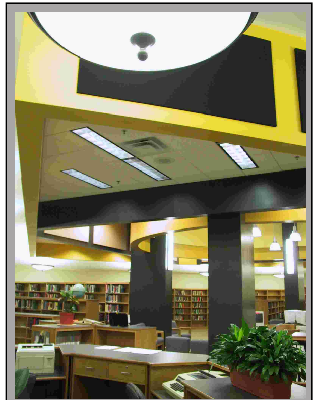
Chuckey-Doak High School

Community Tectonics Architects has offices in Nashville and Knoxville. Its staff includes architects, engineers, planners, and interior and graphics designers.